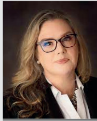
State Rep. Angelia Orr